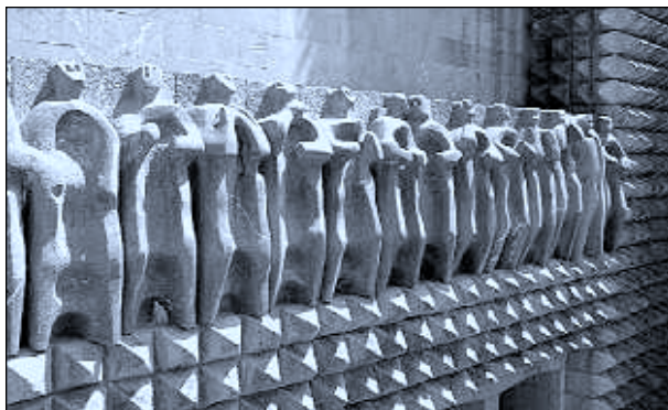
Fig. 2. Arantzazu. The Apostles