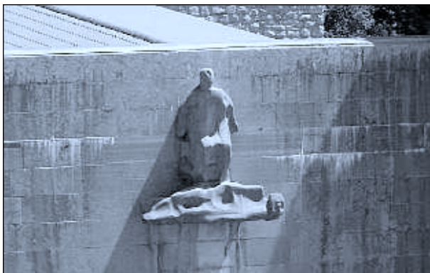
Fig. 4. Arantzazu. The Pietà